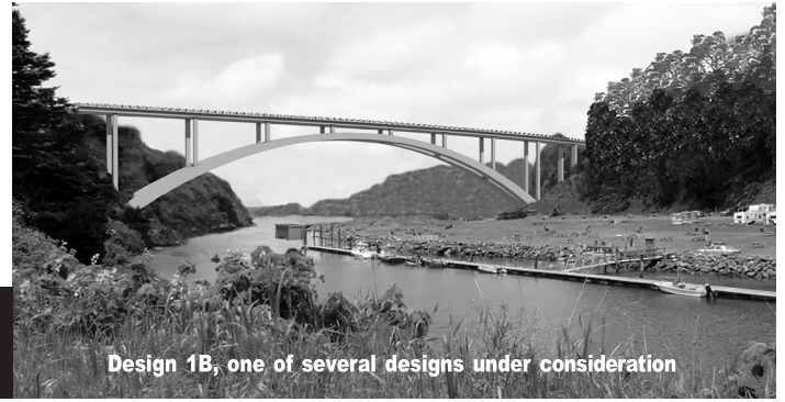
Design 1B, one of several designs under consideration

Albion River Bridge Project State Route 1 — Mendocino County